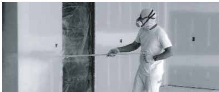
QUICK DRYING - HIGH HIDE

Acrylitex Qwik Prep is designed for use as an undercoating for texture and paint on interior walls and ceilings. Our liability is expressly limited to the replacement of defective product.