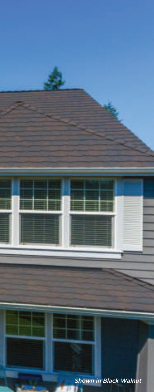
Shown in Black Walnut