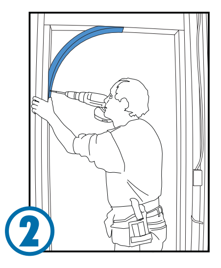
Line up arch segments and screw them in place.