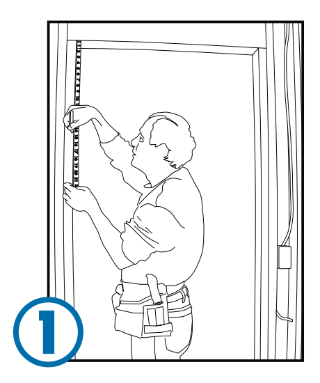
Frame in opening in the usual way, then measure down half the width of the arch.