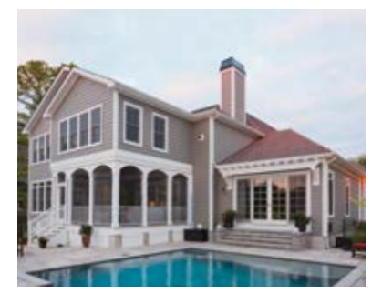
CELECT® CELLULAR COMPOSITE SIDING