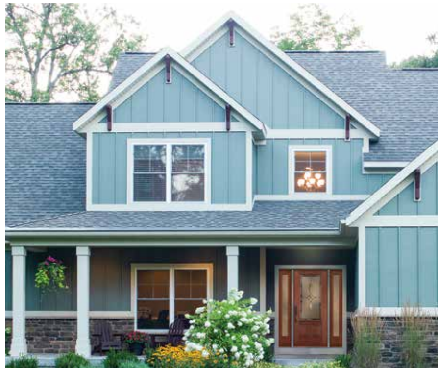
WINDOW & DOOR TRIM