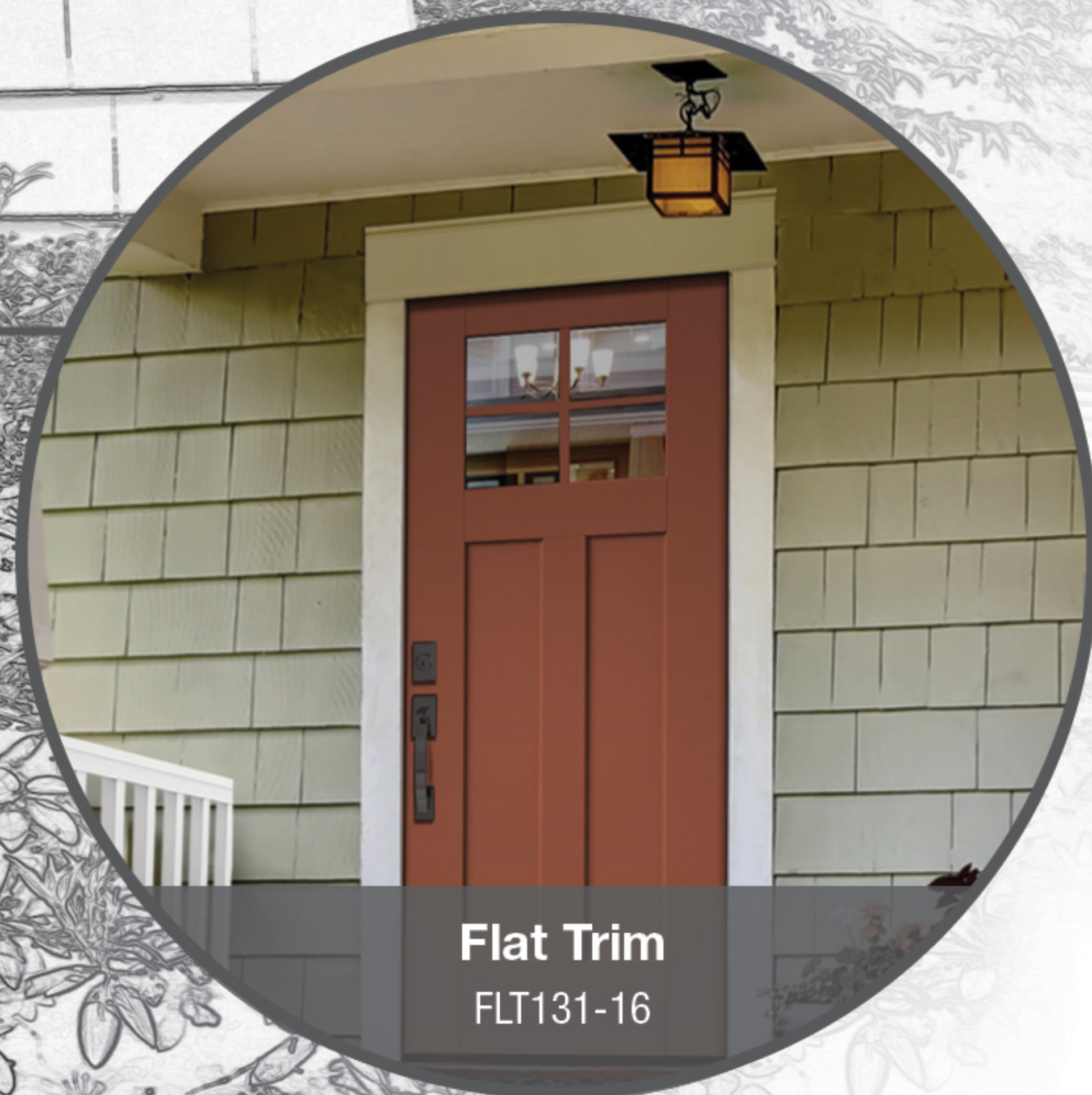
Flat Trim FLT131-16