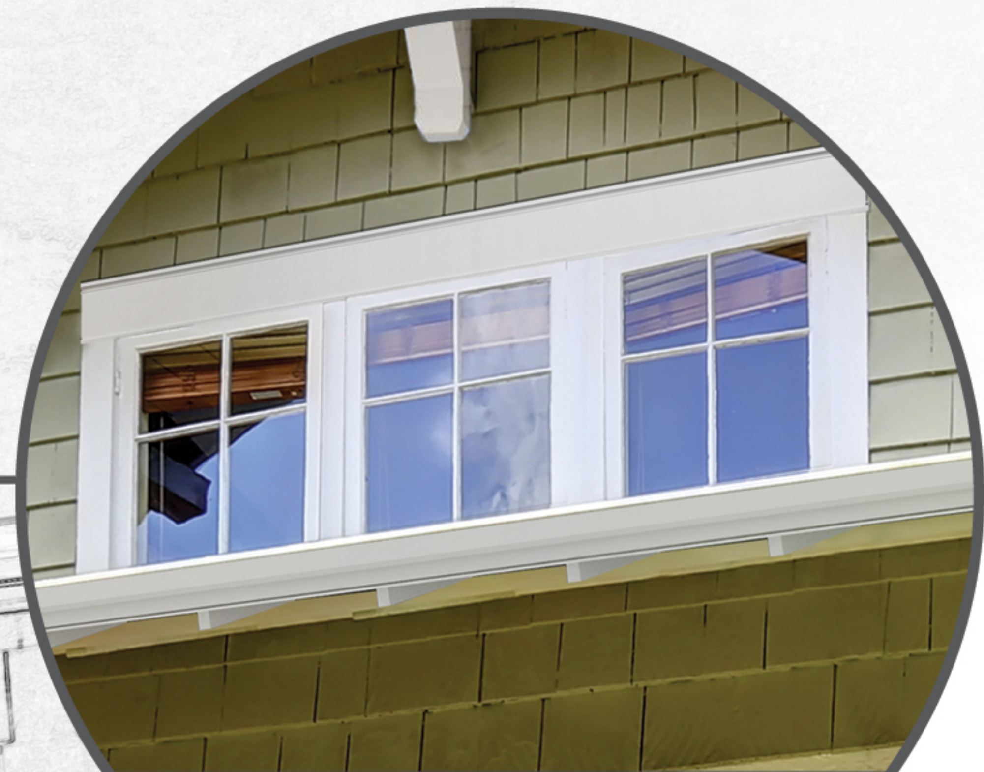
Craftsman Cove Crosshead CHCC56X9BT