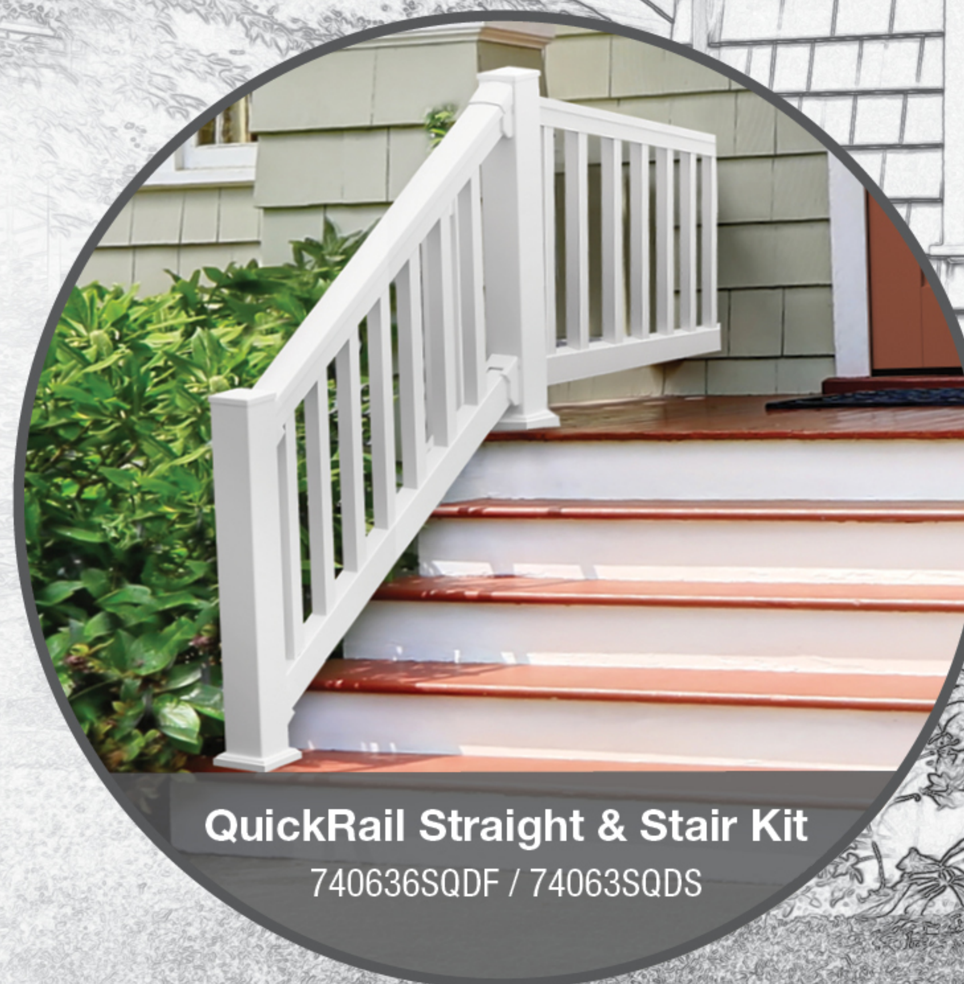
QuickRail Straight & Stair Kit 740636SQDF / 74063SQDS

From corbels and brackets to rafter tails and tapered column wraps. Discover a wide array of traditional architectural accents designed to restore a home's rich Craftsman heritage with authentic details that are easy to install and virtually maintenance free.