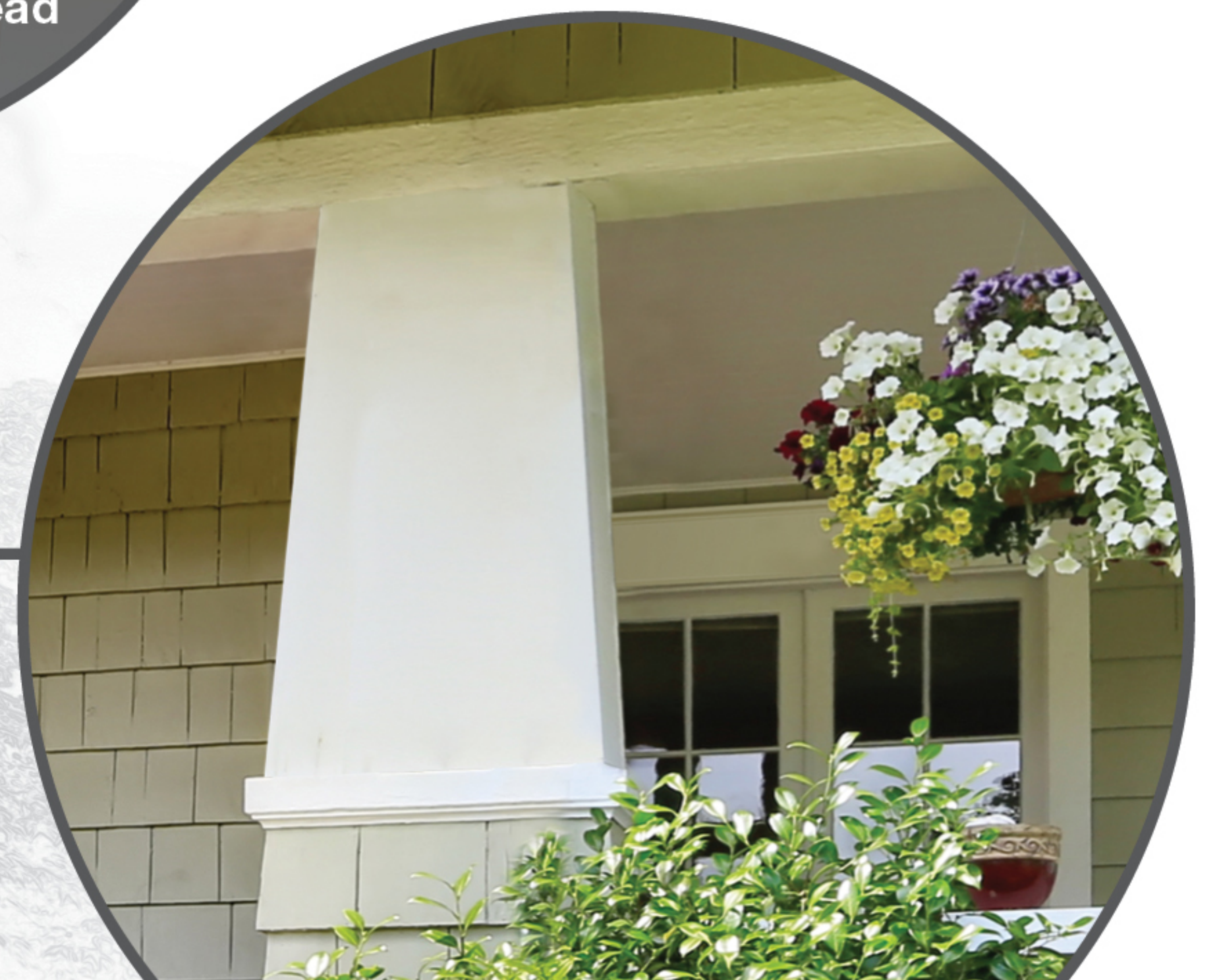
Tapered Column Wrap CWPM16X24X48TFT