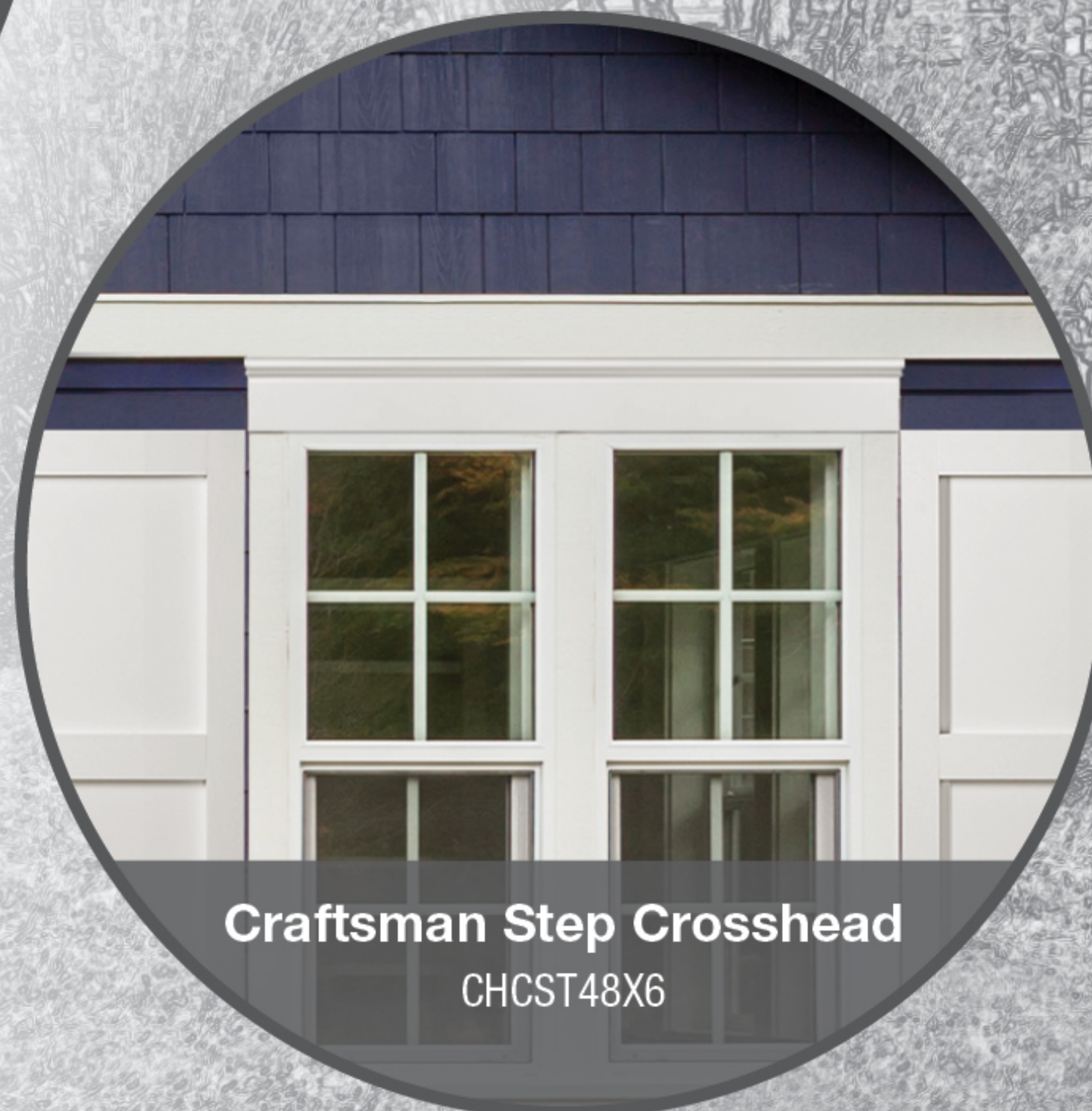
Craftsman Step Crosshead CHCST48X6