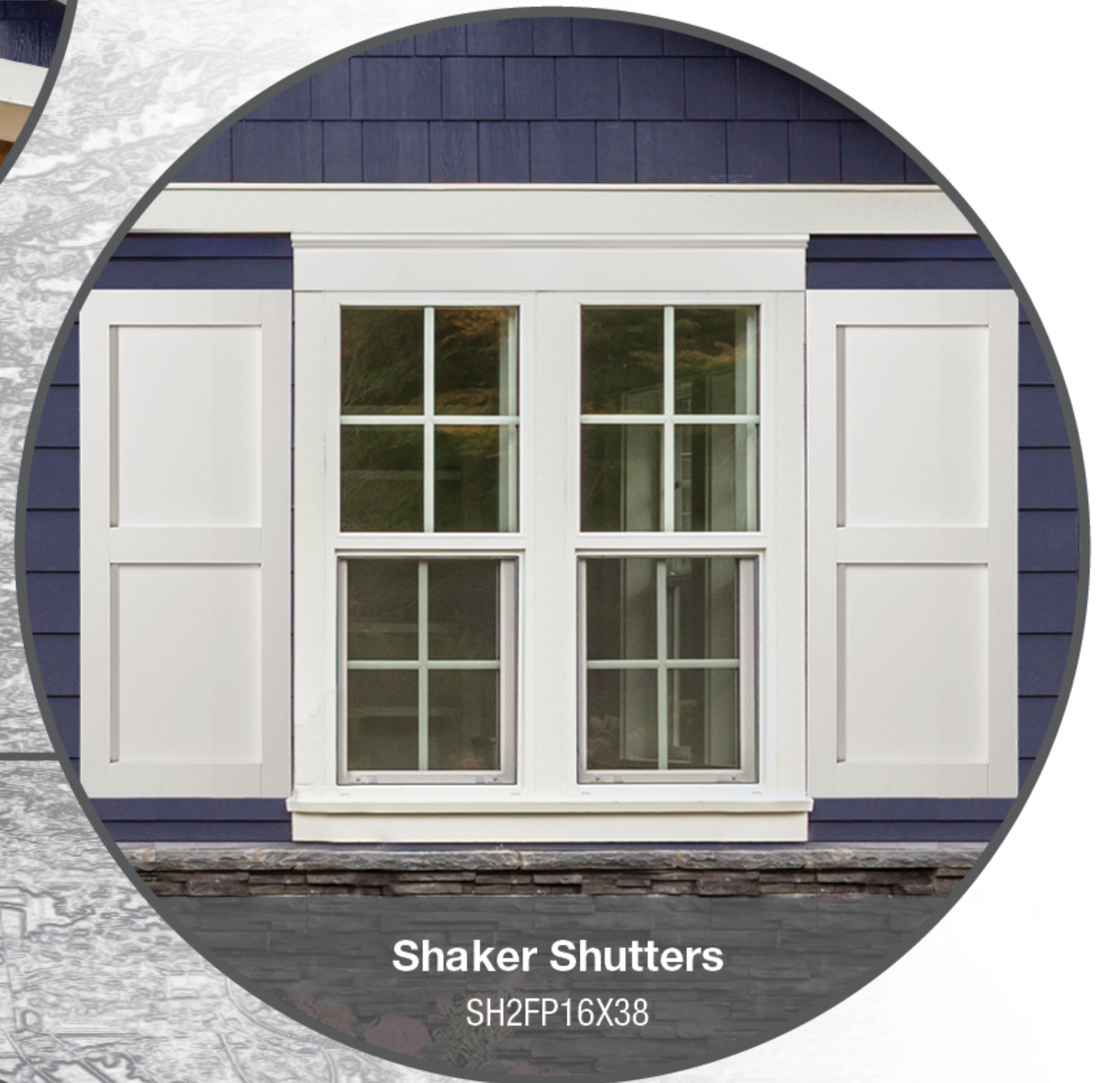
Shaker Shutters SH2FP16X38