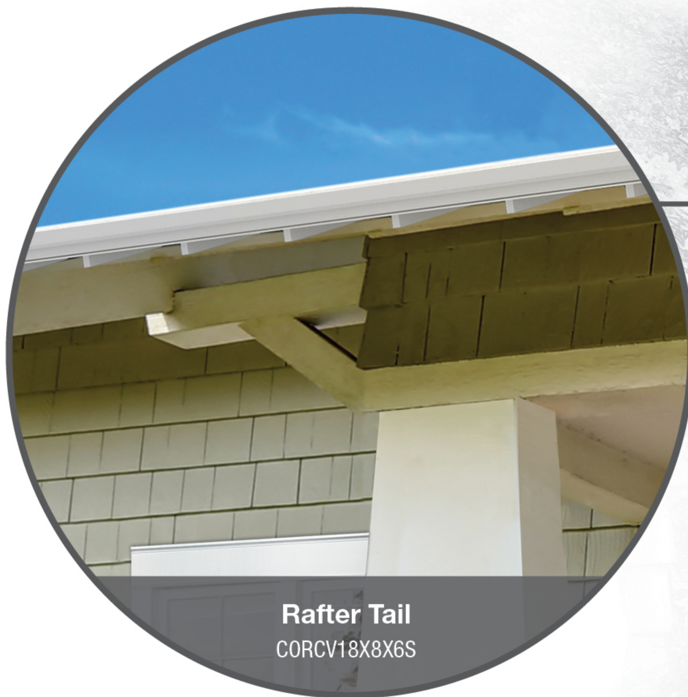
Rafter Tail CORCV18X8X6S