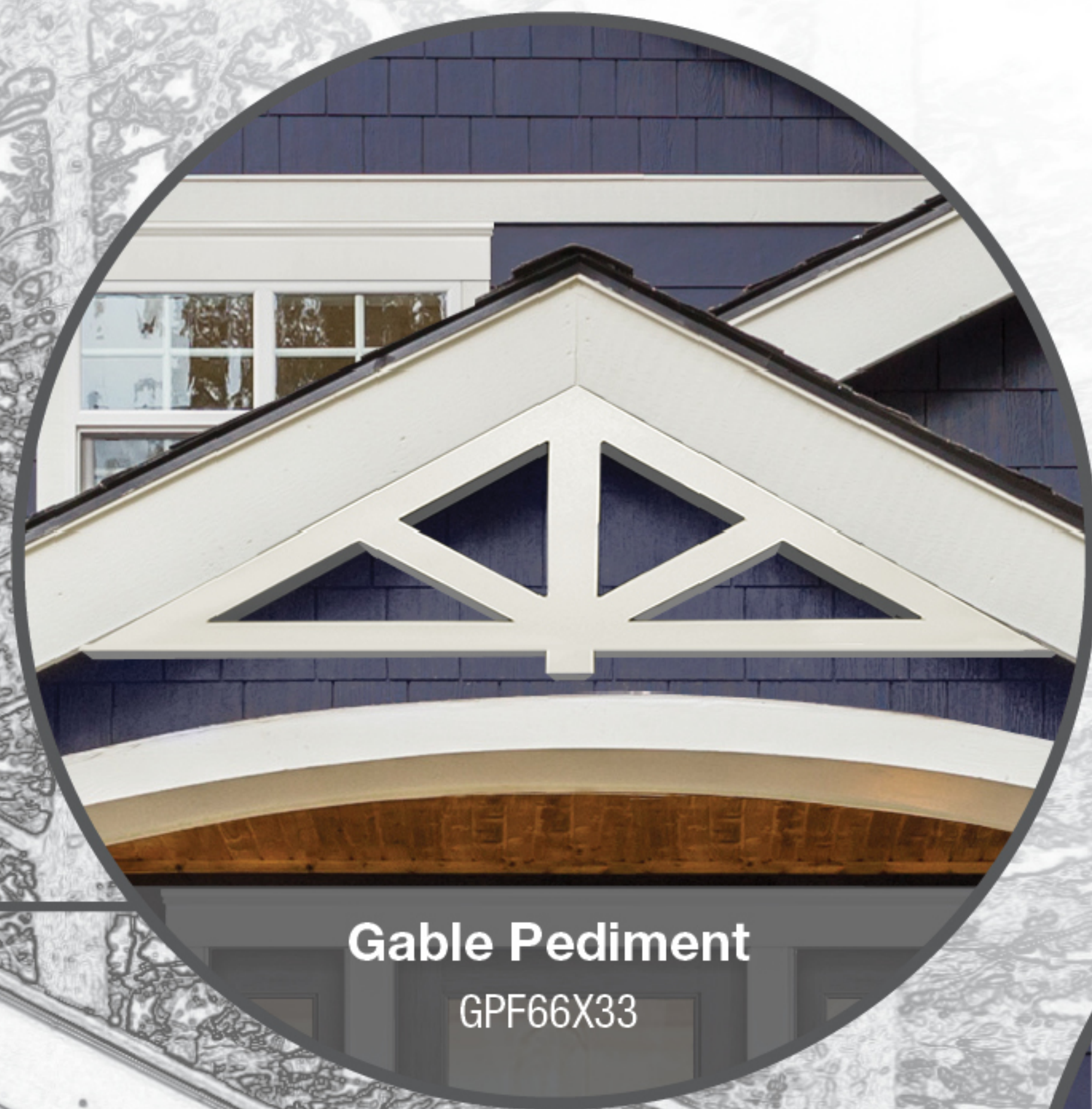
Gable Pediment GPF66X33