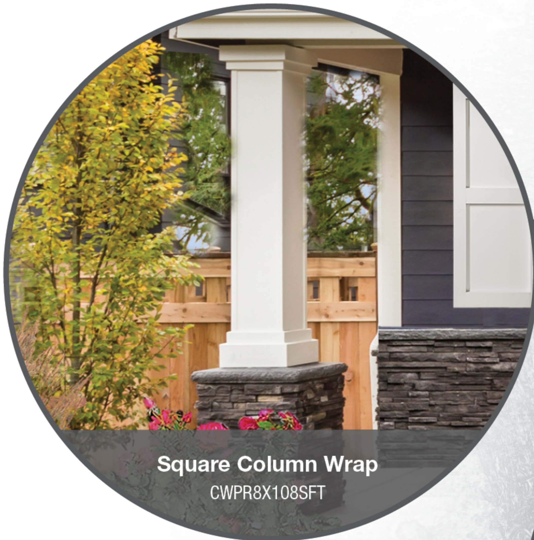
Square Column Wrap CWPR8X108SFT

The building blocks of Craftsman style remain, but with low-maintenance materials and design cues that lend a contemporary feel. Explore Shaker shutters, square column wraps and more – all designed with a modern twist for today's Craftsman homes.