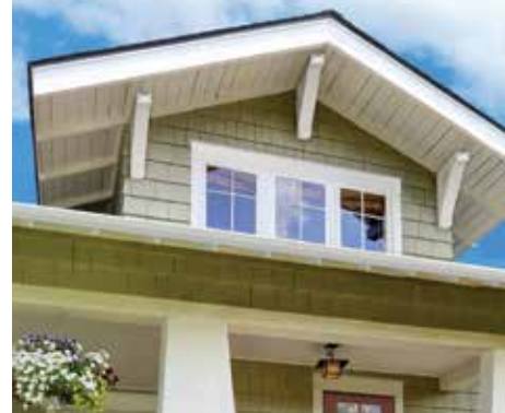
WINDOW & DOOR TRIM