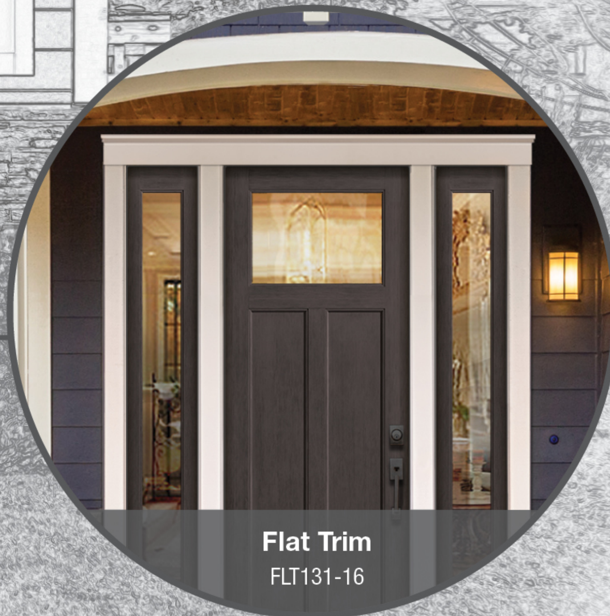
Flat Trim FLT131-16