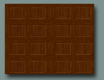
Country with Walnut finish