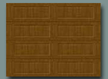
Traditional with Golden Oak finish