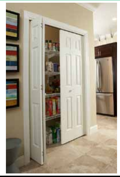
Complete Hardware Set

Specially designed by Johnson. The "Breathing" hinge allows for door warpage, which can cause binding. Self ocating fingers automatically space doors.