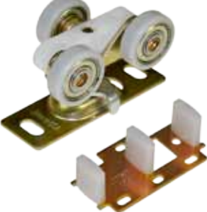
Plus all screws and instructions