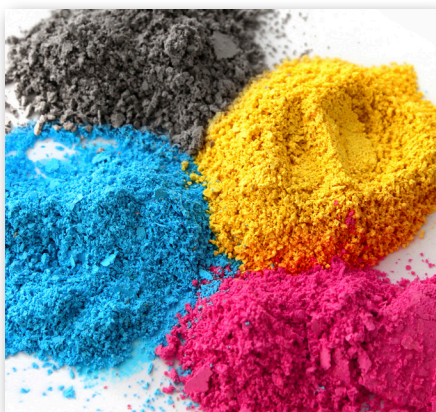
High-quality inorganic and ceramic pigments.

MS Colorfast45 uses a combination of select inorganic and ceramic pigments for coloring. These pigments offer years of exceptional performance in harsh weather and resist color change, acids, alkalis and oxidizing agents found in harsh environments.