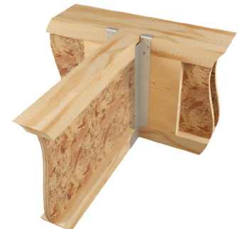
Typical THFI installation