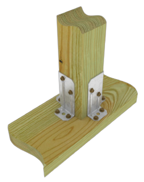
Typical double RPB-TZ wood-to wood installation