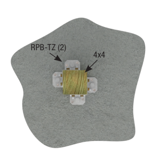
Typical double RPB-TZ concrete installation Min 2-1/2" from any concrete edge (Top view)