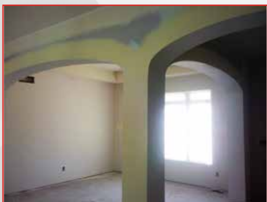
Never-Miss Coloring Gel and Final Coat Ultra White