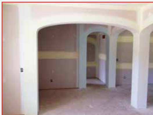
Never-Miss yellow over blue Coloring Gel