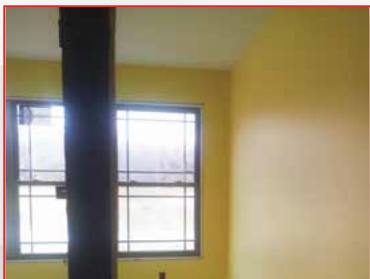
Painted over Final Coat Ultra White