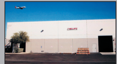
Office & Distribution Warehouse Phoenix, Arizona