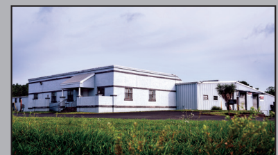
Manufacturing Plant Umatilla, Florida

The ViperStud® Logo, "ViperStud®", "ViperTrack®", and "ViperRib®" are registered trademarks of Ware Industries Inc. and are used by Phillips Manufacturing Co. under license from Ware Industries Inc.