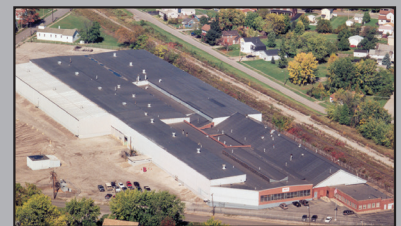
Office & Manufacturing Plant Niles, Ohio