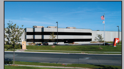
Headquarters & Manufacturing Plant Omaha, Nebraska