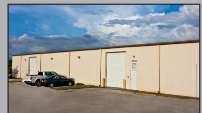
Manufacturing Plant Tampa, Florida