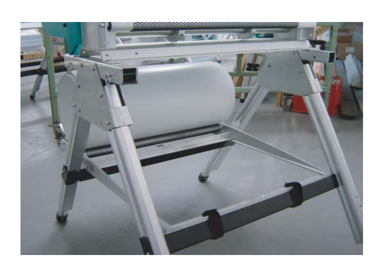
Wrap the velcro around the Pro-Coiler and Slitter Stand to secure the Pro-Coiler as shown.