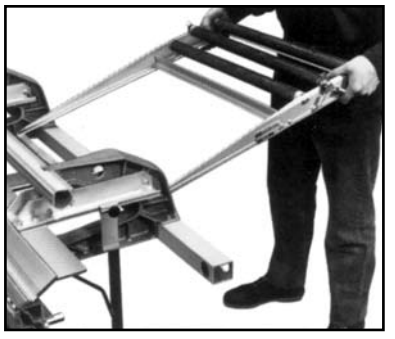
Lightweight and easy to use. Weighs less than 10 lbs. Hooks on to your Brake in seconds.

The portable coil holder that becomes an integral part of your "Windy" SP Port-O-Brake to increase your production and help eliminate waste.