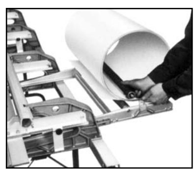
Changes coils quickly. Coil capacity up to 24" wide and 150' long.