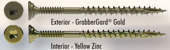
Exterior - GrabberGuard® Gold