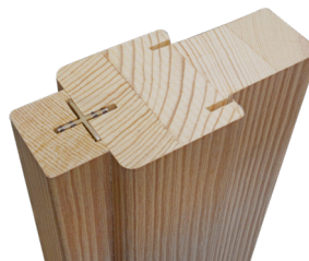
Mull Extender Installed