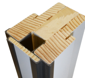
Split Mull Cover Installed

WARNING: Drilling, sawing, sanding or machining wood products can expose you to wood dust, a substance known to the State of California to cause cancer. Avoid inhaling wood dust or use a dust mask or other safeguards for personal protection. For more information go to www.P65Warning.ca.gov/wood .