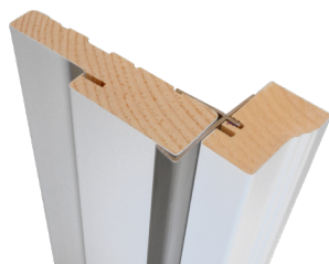
Cut-Down Brickmould Attachment Installed