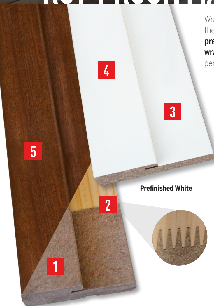
Stainable Woodgrain (Mahogany)