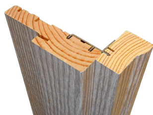
Brickmould Connector Installed